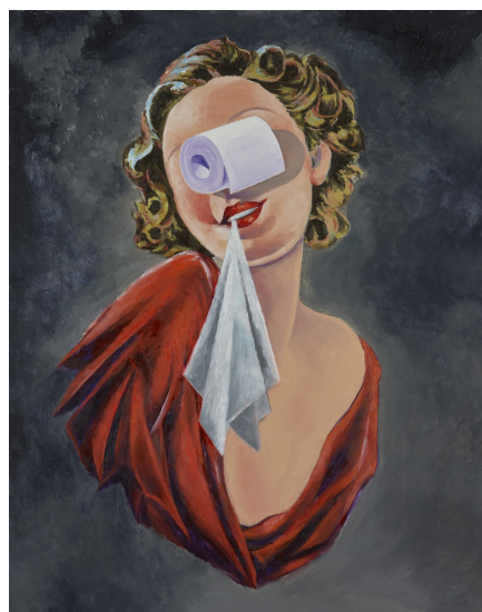
Fig. 6 | Woman with Toilet Paper , 2017

Property of Yokoo Tadanori Museum of Contemporary Art