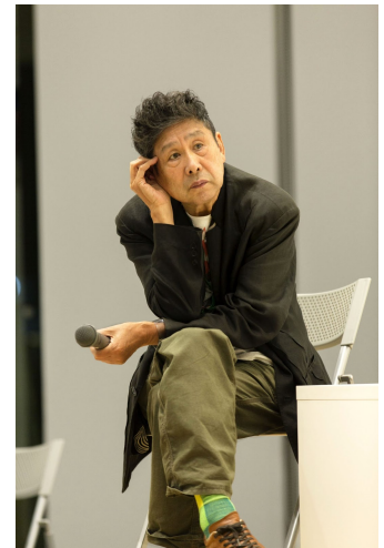
Fig. 2

Yokoo received the 27th Praemium Imperiale Awards In Honor of Prince Takamatsu in 2015. Yokoo's artworks are collected broadly by numerous major museums both in Japan and abroad, and he currently has future solo exhibitions abroad in the works.