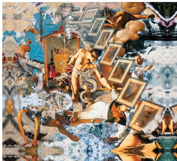
Fig. 4 | The Erased Memory , 1994

Property of the Artist (Long term loan to the Museum of Contemporary Art Tokyo)