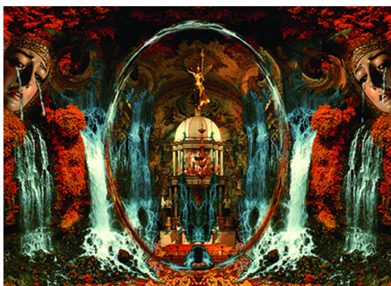
Fig. 5 | Earth Beat , 1993

Property of Yokoo Tadanori Museum of Contemporary Art