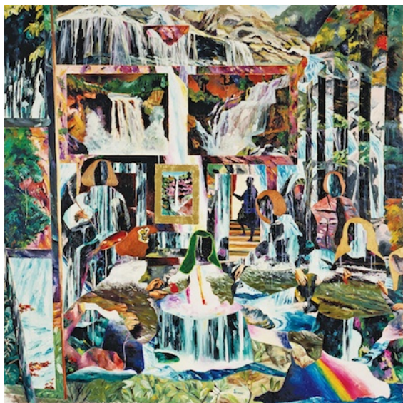
Fig. 3 | Gathering and Dispersing—The Action of Its Power , 1991

Property of the Artist (Long term loan to the Museum of Contemporary Art Tokyo)