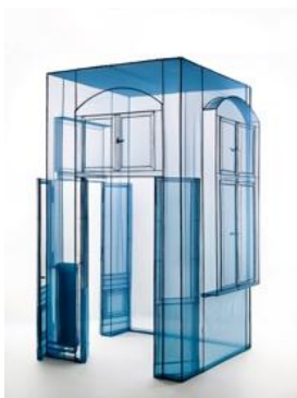
Fig. 4 | Hub , Wielandstr. 18, 12159 Berlin, Germany

Photo by Mami Iwasaki Courtesy the Artist and Lehmann Maupin Gallery, New York and Hong Kong