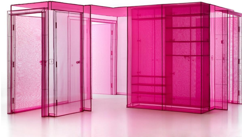
Fig. 1 | Hub , 310 Union Wharf, 23 Wenlock Road, London, N1 7ST, UK, Photo by Taegsu Jeon Courtesy the artist, Lehmann Maupin, New York, Hong Kong and Seoul and Victoria Miro, London/Venice (reference image)

Saturday June 2nd, 2018 – Sunday October 14th, 2018