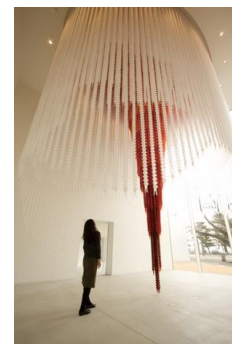
Fig. 3 | Cause and Effect , 2008

Courtesy the Artist and Victoria Miro, London and Venice