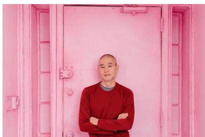
Fig. 2 | Photo by Daniel Dorsa

Photo by Taegsu Jeon Courtesy the artist, Lehmann Maupin, New York, Hong Kong and Seoul and Victoria Miro, London/Venice (reference image)