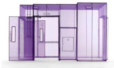
Fig. 5 | Hub , 3rd Floor, Union Wharf, 23 Wenlock Road, London N1 7ST, UK

(reference image)