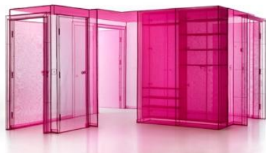
Fig. 1 | Hub , 310 Union Wharf, 23 Wenlock Road, London, N1 7ST, UK

(reference image)