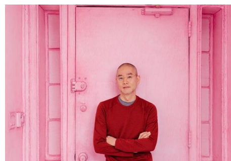
Fig. 2 | Photo by Daniel Dorsa Courtesy the Artist and Victoria Miro, London and Venice

Suh, who lives and works in London, New York and Seoul, has continued to express feelings of cultural displacement through sculptures and immersive installations of domestic architecture and household items. His series of translucent fabric sculptures recreate the textures and delicate details of spaces he himself has inhabited. Suh has dubbed these works “suitcase homes,” so lightweight and portable they can be installed almost anywhere.