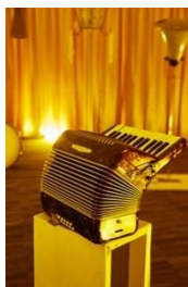
Fig. 7 | Parade (2011–2017), Grey Skies (2017). Fujisawa City Art Space (Kanagawa) (Reference image)