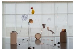
Fig. 8 | Parade (2011–2017), Japanorama (2017). Centre Pompidou-Metz (Lyon) (Reference image)