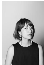
Fig. 2 | Yuko Mohri Portrait