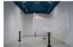
Fig. 9 | polar-oid (o) , Going Away Closer (2018). Wifredo Lam Centre of Contemporary Art (Havana) (Reference image)