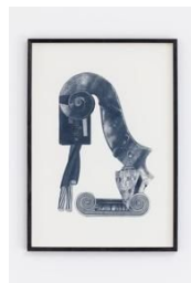
Fig. 5 | Voluta (2018), Voluta (2018). Camden Arts Centre (London)