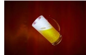
Fig. 6 | Everything Flows: This is not Ocean (and I Did not Drink Beer) (2017), Grey Skies (2017). Fujisawa City Art Space (Kanagawa) Photo by Ayumi Matsuura Photo courtesy Fujisawa City Art Space (Reference image)