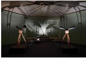
Fig. 1 | Scenes from 2018 exhibition Childhood , Palais de Tokyo (Paris). (Reference image)