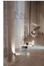
Fig. 3 | Moré Moré (Leaky) Variation #1 (2017–2018), Sensory Agents (2018). Govett-Brewster Art Gallery/Len Lye Centre (New Plymouth) (Reference image)