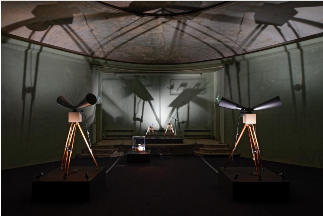
Scenes from 2018 exhibition Childhood , Palais de Tokyo (Paris)

Saturday October 27, 2018 – Sunday March 24, 2019