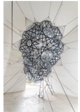
Tomás Saraceno, On Clouds (Air-Port-City) , 2008