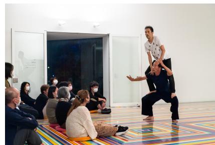
Behaviour Problem Trio, Summer Night Festival, 2021 "Arts Towada 10th Anniversary Exhibition: Inter+Play"