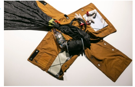
Tomás Saraceno, Aerocene Backpack, 2016

Saraceno most recently exhibited his work at Palazzo Strozzi in Florence for "Aria" (Italy, 2020), the 58th Venice Biennale as part of "May You Live In Interesting Times" (Italy, 2019), and at the Palais de Tokyo in Paris for his Carte Blanche exhibition "ON AIR" (France, 2018).