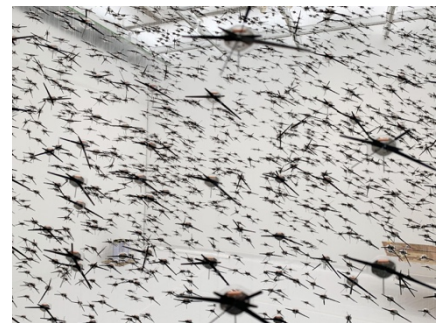
目 [mé], movements , 2019 "Obviously, no one can make heads nor tails." (Chiba City Museum of Art)

For Season 2, art collective 目 [mé] will present movements inside of their installation space. A stark-white gallery embedded in a building in downtown Towada, space features different artworks for the first and second half of the exhibition. movements , on display for the second half of the exhibition, may look like a swarm of countless black creatures when viewed from above, but upon closer inspection, these little creations each move mechanically, noisily ticking away with the movements of the clock.