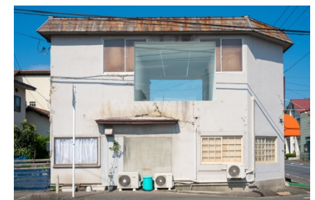
目 [mé], space, 2020 "Arts Towada 10th Anniversary Exhibition: Inter+Play"