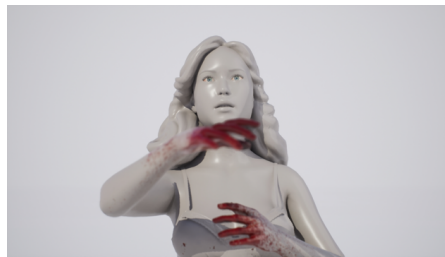
Jokanaan , 2019 Two-channel video installation, 12' 26"