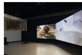
Incubation Diary 2014-2015, 2016/2018 Video installation Installation view from Yebisu International Festival for Art & Alternative Visions 2018: Mapping the Invisible