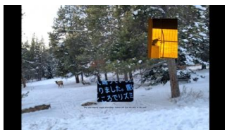
A Calendar Story for You Waiting at Home , 2021 Video installation