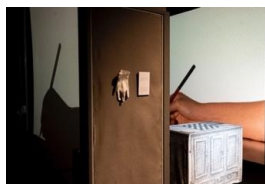
Her Rights: The Turk of Frankenstein; or, The Modern Prometheus , 2019 Video installation