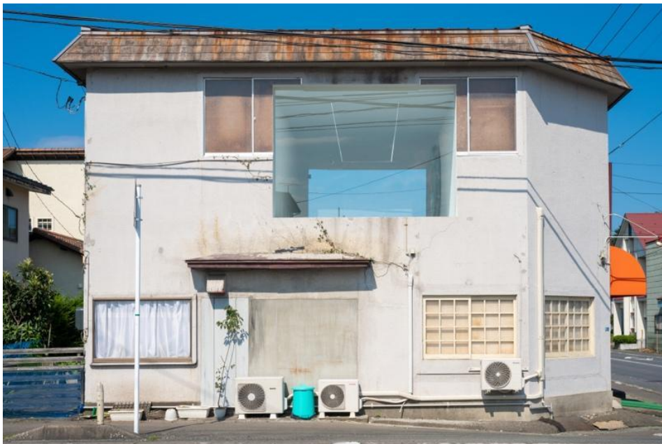
目 [mé], space

The Towada Art Center is proud to announce space as our newest gallery, located in downtown Towada just a 7-minute walk from the art center. A work of art in and of itself, space is a bold renovation of an empty building into a gallery space by the art collective 目 [mé] as part of the Arts Towada 10th Anniversary Exhibition: Inter+Play , which concludes in May 2022. The location will serve as a Towada Art Center satellite venue from July 2022 onward.