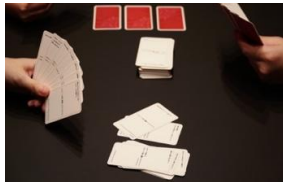
Executioners Accompanists, 2022