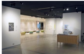
margin reception , 2021