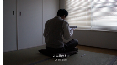
Fixed Point Observation (With My Father), 2013–2014 Single-channel video, 10'26"