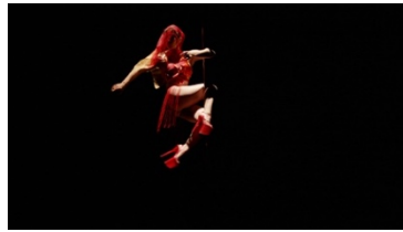
Flos Pavonis, 2021 Single-channel video, 30'