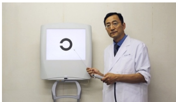
The Examination, 2014 Single-channel video, 7'2"