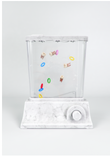
Interpreter, 2022 Inkjet print on paper. Size variable.