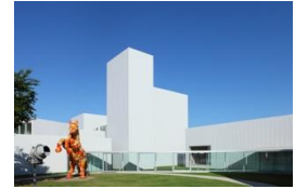
Towada Art Center