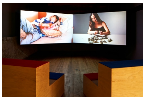
Bivalvia: Act II, 2022 , installation view at MUJIN-TO Production photo: Morita Kenji