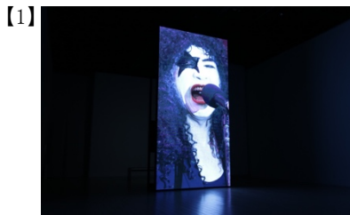
[1] Unmasked (Bootleg) , 2023, installation view at Tokyo Photographic Museum of Art

Towada Art Center Communications: Otani Sae