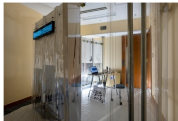
ON/OFF and the shore 2022, Photo: TOKYO PHOTOGRAPHIC RESEARCH *Reference work