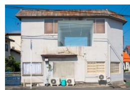
目 [mé], space , 2020