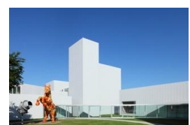
Towada Art Center