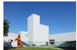
Towada Art Center

*When using images to 2–5, please also include the following credits.