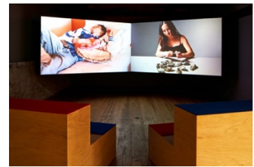
Bivalvia: Act II , 2022 HDV installation *Reference work