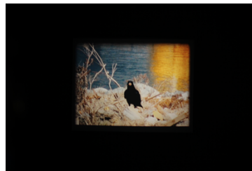
ALMOST DOWN , 2012 16mm film, installation *Reference work