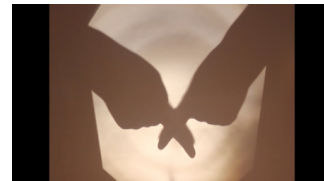
Shadow of ABC , 2021