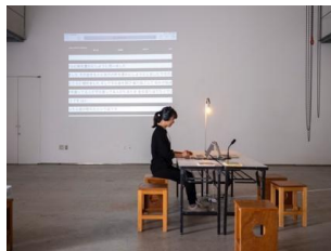
That Long Moonless Chase , 2023