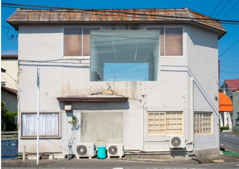
目 [mé]space

Since 2022, the Towada Art Center has been operating space —an empty building repurposed into a gallery space by the art collective 目 [mé]—as a satellite venue. Located on the second floor, the white cube gallery of space stands in stark contrast with its surroundings and is now used to showcase the experimental work of emerging artists.