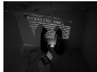
Regular Irregularity , 2021