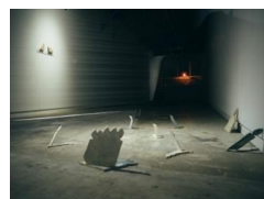
Installation view of solo exhibition Quantum Teleportation (2023)