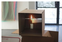
Candle Flames , 2023