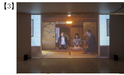
[3] HONEYMOON , 2020, installation view at Pola Museum of Art