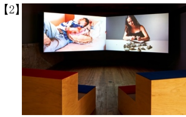
[2] Bivalvia: Act II , 2022, installation view at MUJIN-TO Production photo: Morita Kenji