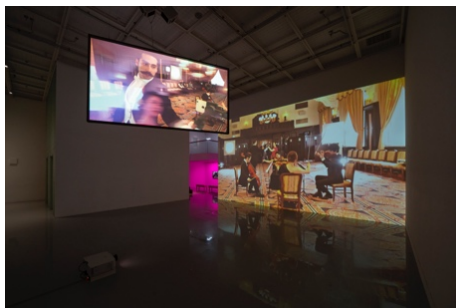
The Last Ball, 2019 , installation view at Shiseido Gallery