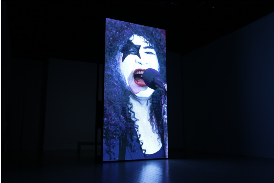
Unmasked (Bootleg) , 2023, installation view at Tokyo Photographic Museum of Art

From December 9 2023 to March 31 2024, the Towada Art Center will present an exhibition of work by artist Yu Araki.