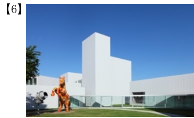
[6] Towada Art Center