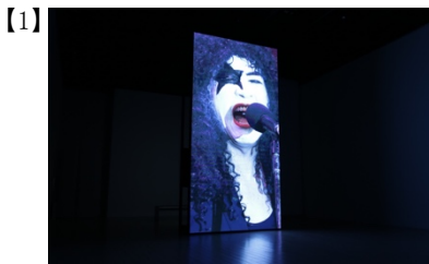
[1] Unmasked (Bootleg) , 2023, installation view at Tokyo Photographic Museum of Art

Towada Art Center Communications: Otani Sae