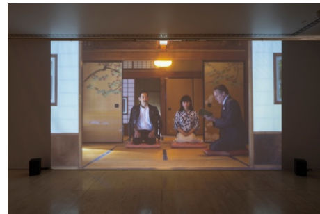
HONEYMOON, 2020 , installation view at Pola Museum of Art