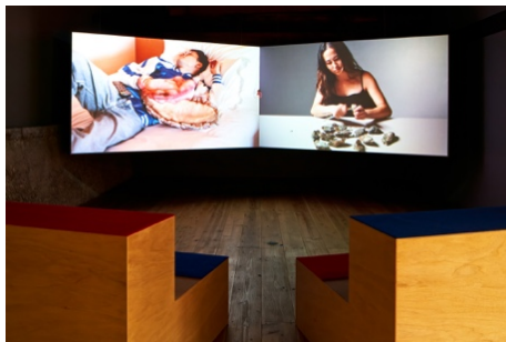
Bivalvia: Act II, 2022 , installation view at MUJIN-TO Production photo: Morita Kenji