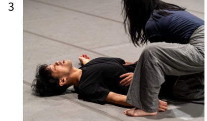
Air Crip , 2023 60min, Dance Reference image