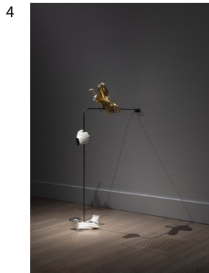
Pulp Physique #8 , 2022 Reference image