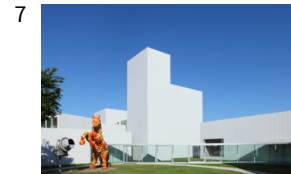
Towada Art Center