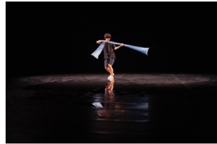
Gallop, 2022 90min, Dance Reference image