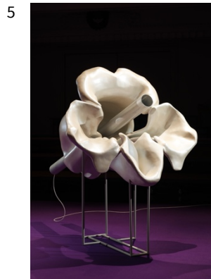
Corpse of Whale , 2019 Reference image