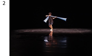
Gallop , 2022 90min, Dance Reference image