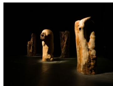
WORMHOLE , 2024, on view at Sapporo International Art Festival 2024.