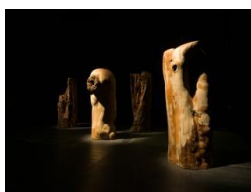
WORMHOLE , 2024, on view at Sapporo International Art Festival 2024