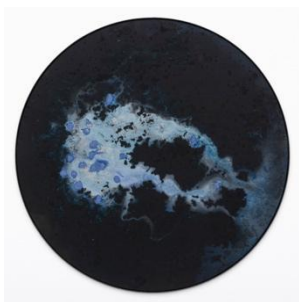
COSMOS , 2024, 90 × 90 cm, acrylic on panel / iron.