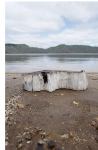
GLACIER MOUNTAIN , 2024, 17.5 × 60 × 29 cm, chalk and soil on wood (Japanese yew).