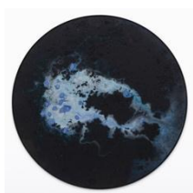
COSMOS , 2024, 90 × 90 cm, acrylic on panel / iron