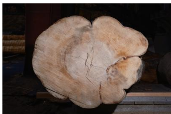
Aomori beech tree from the Oirase area of Towada