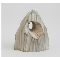
ICE CAVE , 2024, 40.5 × 36.5 × 30 cm, chalk on wood (Katsura tree)