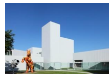
Towada Art Center