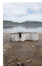
GLACIER MOUNTAIN , 2024, 17.5 × 60 × 29 cm, chalk and soil on wood (Japanese yew)