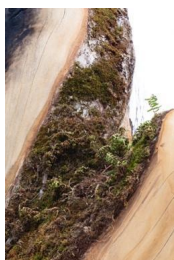
Left two images: WORMHOLE , 2025, approx. 390 × 120 × 100 cm, wood (mizunara oak). On view at Osaka Expo 2025, Exhibited at Connecting Lives Zone, Pop-up Stage North, Sky Plaza.