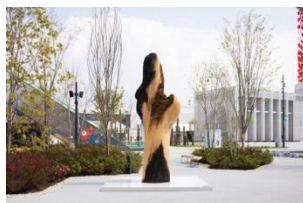
(2) (3) WORMHOLE , 2025, approx. 390 × 120 × 100 cm, wood (mizunara oak) On display at Osaka Expo 2025 Exhibited at Connecting Lives Zone, Pop-up Stage North, Sky Plaza